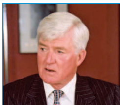
The Rt. Hon Lord Parkinson, President and Senior Non-Executive Director (72)

Lord Parkinson was appointed to the Board in July 2000 as a non-Executive Director and is a member of both the Audit and Remuneration Committees of the Group. Lord Parkinson is a Member of the House of Lords and was a Member of Parliament from 1970 to 1992, during which time he held a number of senior ministerial positions including Secretary of State for Trade and Industry, Energy and Transport. He was Chairman of the Conservative Party from 1981 to 1983 and again from 1997 to 1998. A qualified chartered accountant, Lord Parkinson was a Partner in Westwake Price (City Chartered Accountants) for 10 years and is currently Chairman and Director of a number of companies including Jarvis Group Limited, Huntswood plc and the Le Carbone UK Group of Companies.