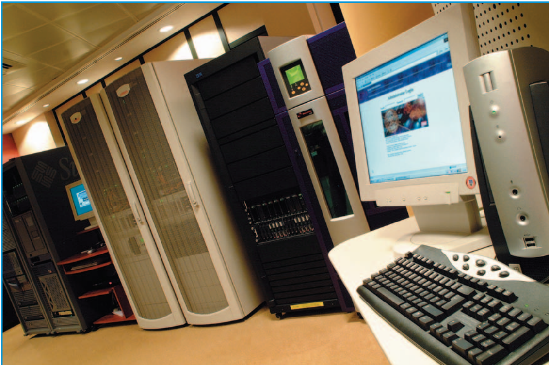
Proof of concept - the InTechnology Solutions Centre, London

Allasso provides strong technical, sales and consultancy support to its reseller partners in identifying the appropriate solution for each client from its strong portfolio of security products. Other professional services provided for clients include training and post-sales technical support.