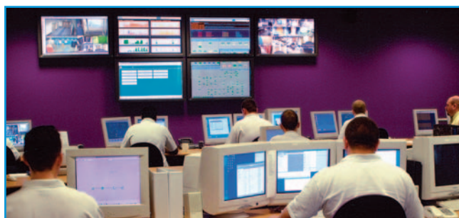
Managed Services - InTechnology's secure data centre